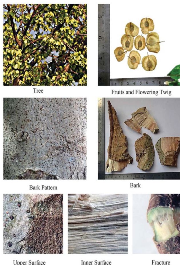
Plate Number: 0

Figure 1. Morphological characters of tree Macroscopical characters of Bark of Holoptelea Integrifolia (Roxb.) Planch, plate number 0.